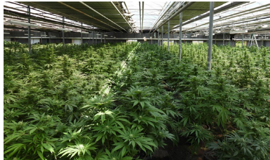
PJFCET Project Woolwich